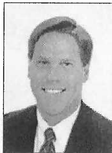
JIM FERRELL Deputy Mayor