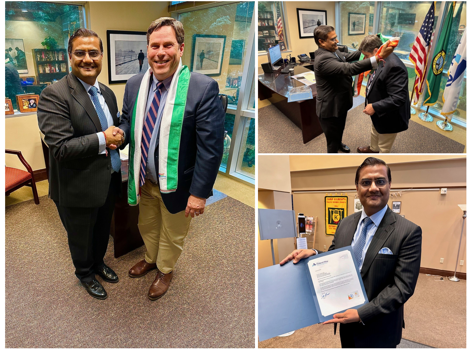
Mayor Jim Ferrell welcomed Consul General Prakash Gupta and the delegation from the new Indian Consulate in Seattle to Federal Way for a tour on January 22. The City of Federal Way is committed to establishing a solid partnership with our friends at the Indian Consulate in the greater Seattle area. The City of Federal Way is proud to support India, which celebrated its 75th Republic Day on January 26!