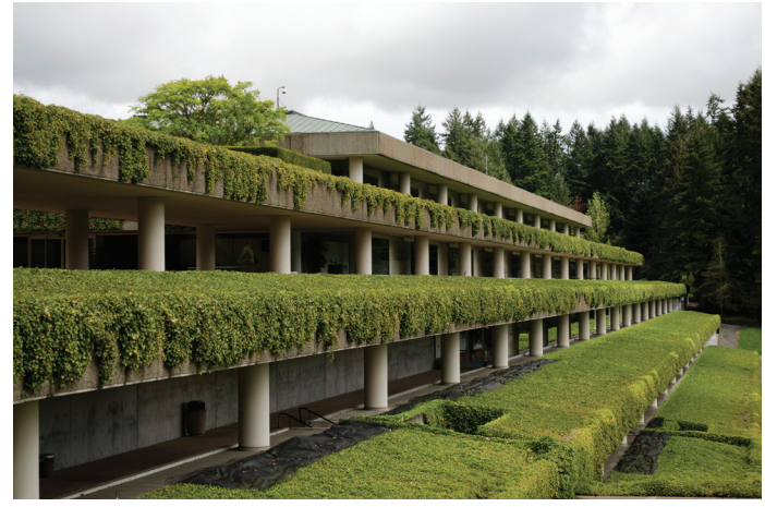
Former Weyerhaeuser Headquarters